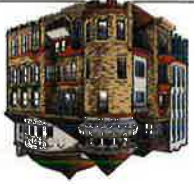
BURCH, PORTER & JOHNSON, PLLC